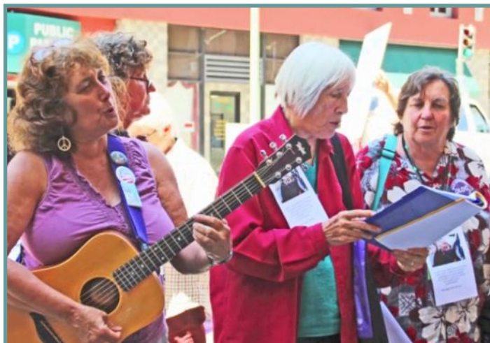
Bay Area demonstration — See article on pg 6.

Excerpted from a longer article that appeared in the (San Francisco) Bay Area Times, June 2015.