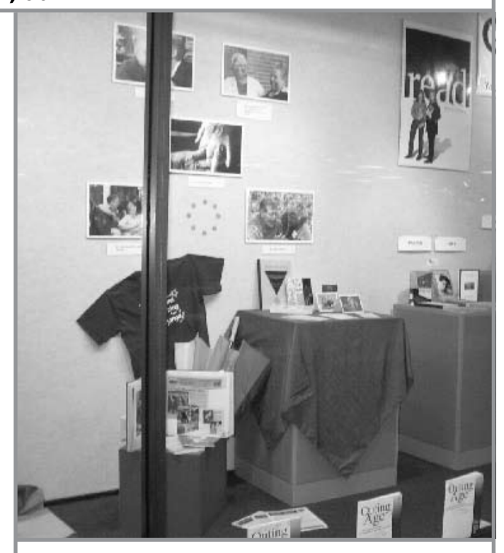
The OLOC exhibit in the Hennepin County Courthouse (in Minneapolis, MN) featured enlargements of the age-postive greeting cards produced by the local OLOC contingent, an OLOC T-shirt, copies of The Reporter and a scrapbook filled with photos and articles regarding OLOC's work in Minnesota.

So, hey — you other OLOC regional groups out there — let's see what you can do!