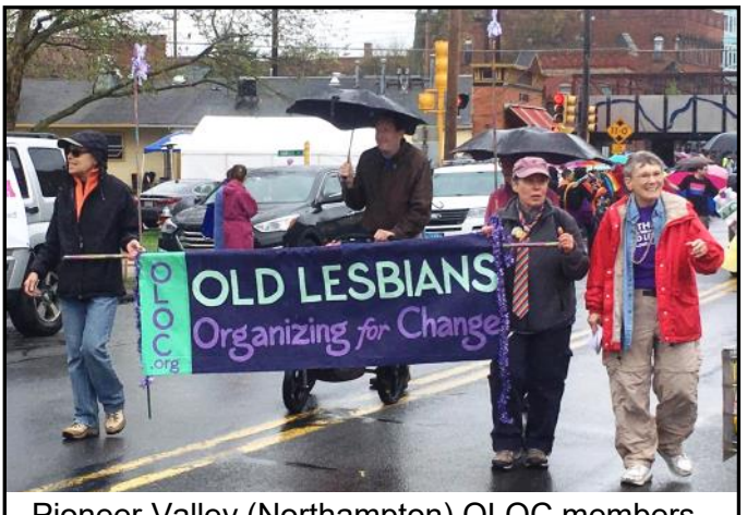
Pioneer Valley (Northampton) OLOC members in 2016 Pride Day parade