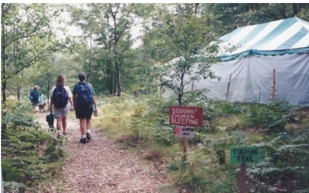
Walking along Tubman Trail at Michfest

If OLOC Gatherings do not duplicate the Festival experience, we do dedicate space and extended time for us to connect and enjoy each other's company to the happy sounds of female voices.