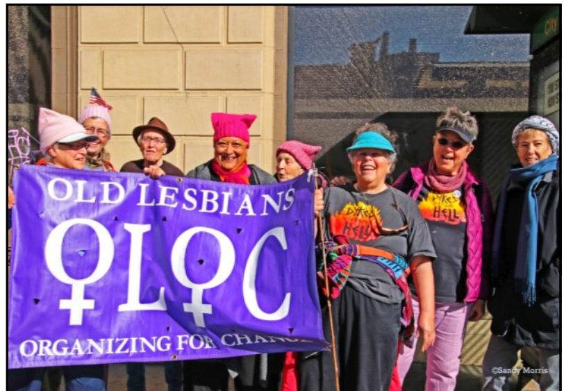
Bay Area OLOC at Women’s March in Oakland