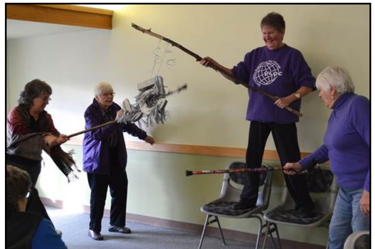
Northern Colorado Chapter with a piñata

The OLOC Media Library is a huge resource for meeting activities. Showing films, discussing them, and coming up with actions is an important way to stay alive in this current repressive environment.