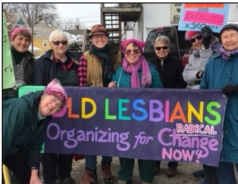
Pioneer Valley OLOC at Women’s March