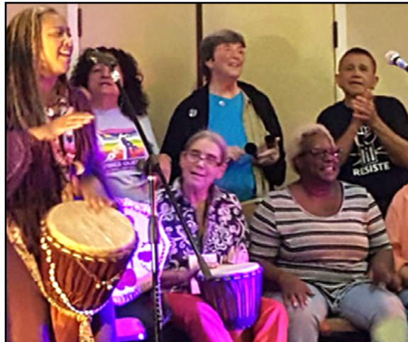
Some of who “we” are, Tampa, Florida, 2017

It continues to promote the systemic, underlying, ubiquitous, ongoing, relentless racism in the US and on Earth. It makes invisible all of the many Lesbians of Color in OLOC and elsewhere. OLOC is not and has never been an only-white group. Saying