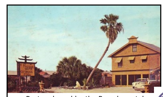
Postcard used by the Pagoda motel between 1970 and 1977

Being raised working class or poor means you work for what you need or you don't get it. You also may believe you don't even deserve to get work that will meet your needs, and you certainly don't ask for something like an almost free ride to a Gathering. You just don't ask.