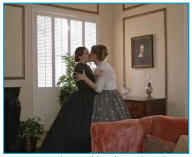
A scene from Wild Nights with Emily

Wild Nights-Wild Nights! Were I with thee Wild nights should be Our luxury! Futile-the windsTo a heart in portDone with the CompassDone with the Chart! Rowing in EdenAh-the Sea! Might I but Moor-tonightIn thee!