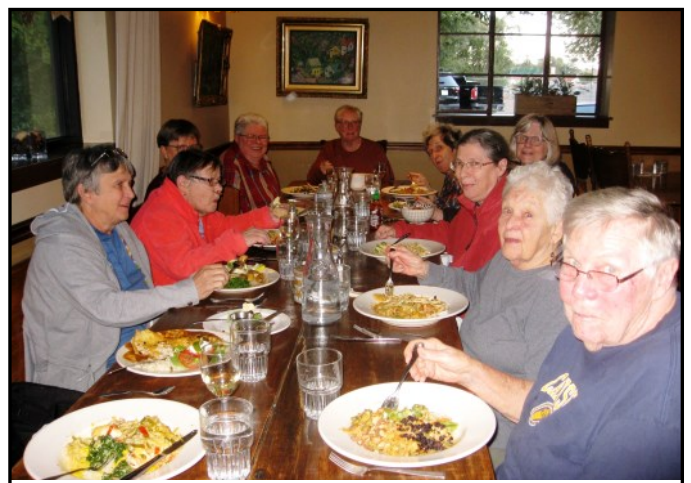
Colorado OLOCers sharing breakfast

(To plan this retreat, our first step was to find a location that was at an altitude that worked for everyone and that could accommodate our group. We wanted something with common meeting spaces and where each person could be responsible for booking and paying individually, including deposits. Finally, we wanted a location where there were outside things to do.)