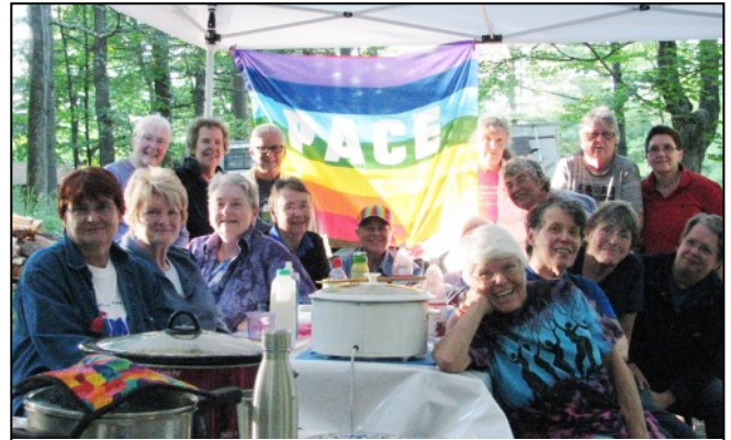
Pioneer Valley OLOC

November offered Improv workshops, and in December there will be a Solstice party potluck. Many members expressed how important OLOC is to us and how much we appreciate the hard work National does to guide us.