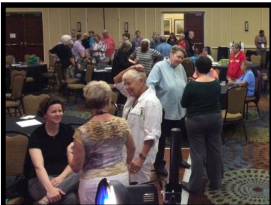
OLOCers at the Gathering