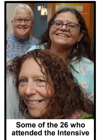
Some of the 26 who attended the Intensive

Everyone participated in the discussion. Good ideas and personal experiences were shared, and I felt the camaraderie among the participants. I feel confident that this Gathering will result in bringing about many positive changes for Lesbians of all Colors.