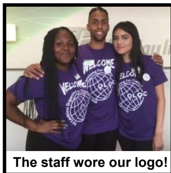
The staff wore our logo!

I was apprehensive about August in Florida since I hate hot and humid weather. But the hotel, as promised, was cool and quiet and comfortable. But what I did not expect was such a hearty, warm welcome from the hotel staff. It started with a gigantic welcome mat on the floor in front of the desk [above]. Our OLOC logo dominated the entrance lobby, and the buffets, the food, and the people who served it were all more than anyone could ask for.