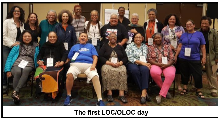
The first LOC/OLOC day

First thing on Saturday, I went to Ubaka Hill’s “The Power and Joy of Women’s Drumming” workshop with a borrowed drum to