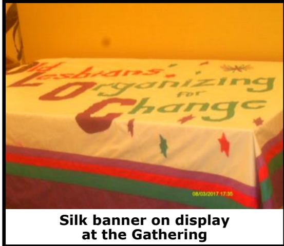
Silk banner on display at the Gathering